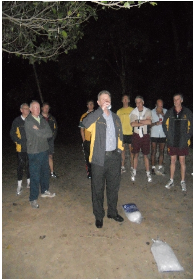
850 runs? That doesn't look like running gear to me!