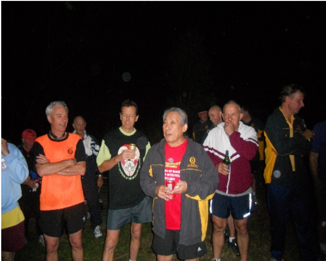
“Snappy explaining correct Ballsup etiquette”

Those hares were on top of their game, as they had their own beers available as the pack arrived, with many hashmen grabbing a cold one to quench a thirst. Only when opening it only to discover they then had to fork out $3.00 for a non-hash beer.