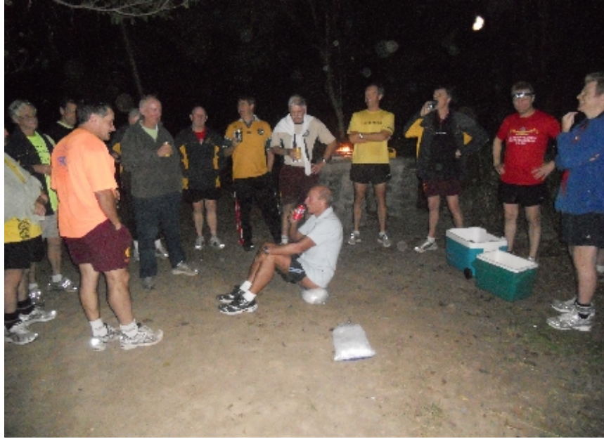
Ringbark spinning yarns about the 3 ways to do things